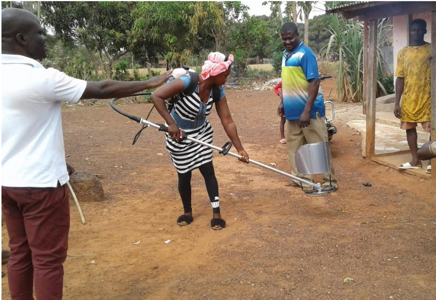
A MEMBER OF JOPOKU RICE FARMER GROUP BEING TRAINED ON THE OPERATION OF RICE REAPER AT ABUSUAPEAD ENGINEER